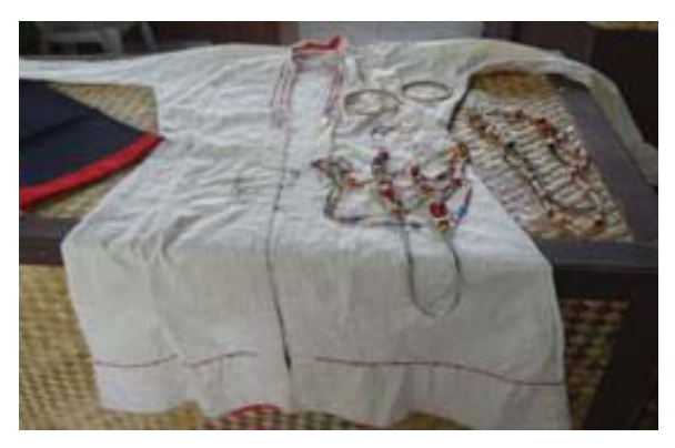
Figure 3. A white female upper garment that is claimed to be more than a hundred years old taken from the Municipality of Dumingag, Zamboanga del Sur.