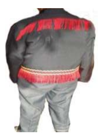
Figure 6. Tassles at the back and edges of the upper garment.

Unlike before wherein four colors of abaca threads were visibly sewn at the edges of upper garments for male and female natives, the costumes now bear red, yellow, and green laces instead of thread or abaca fibers. Likewise, some costumes for male Subanens make use of tassles attached at the back or at the edges of the garments, a kind of decoration that was not present in the garments of the early Subanen generations (Figure 6).