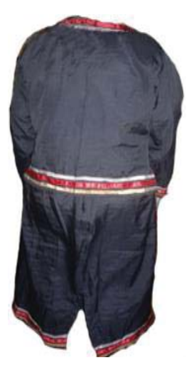
Figure 8. A Subanen costume with a slit at its back (Ozamiz City).