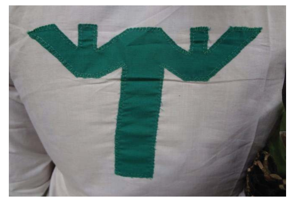
Figure 4. The image of betel leaf sewn at the back of the white garment.

yellow, and green are colors of the rainbow which is believed to be one of the belts of 'Si Bae Bulan,' a deity who constantly cooks and offers porridge to anyone who arrives in her heavenly place. The colors found on the Subanen costumes signify tribal beliefs in supernatural beings.