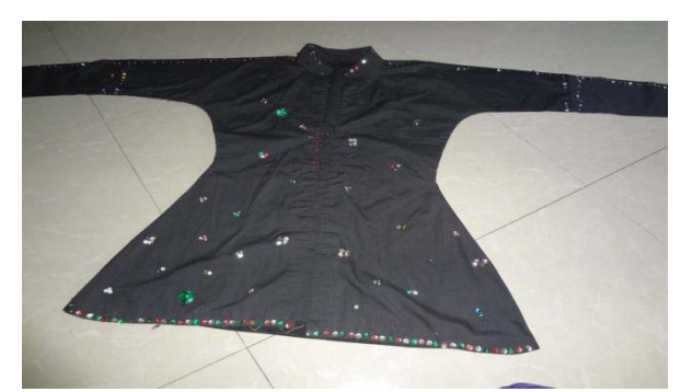
Figure 2. A black female upper garment that is approximately a hundred years old taken from Ozamiz City, Misamis Occidental.