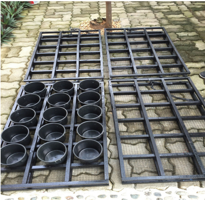
Plate 2. The Ovitrap and Braces