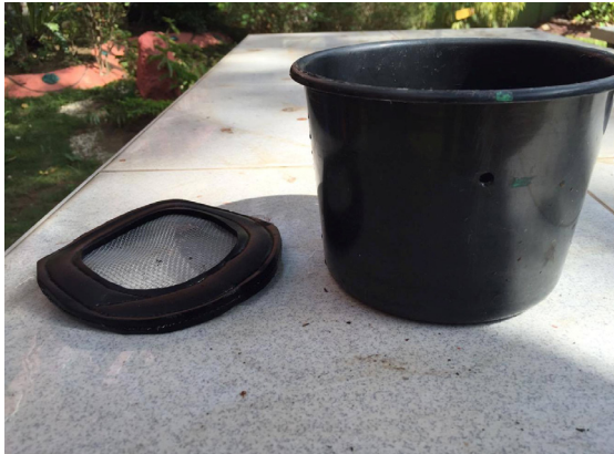
Plate 1. The Ovitrap