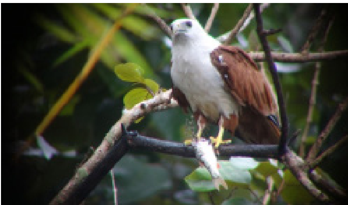
Figure 3. Brahminy Kite ( Haliastur indus ) foraging on a tree in Barangay Los Amigos, Tugbok District, Davao City.